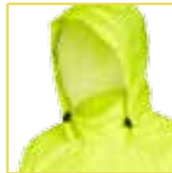
Three piece hood