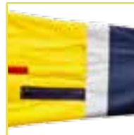
Left sleeve pocket with zip