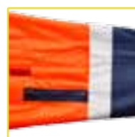
Left sleeve pocket with zip