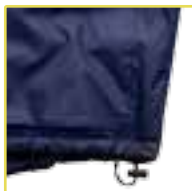
Internal draw cords