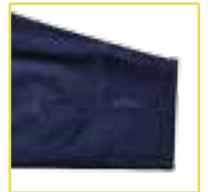
Adjustable velcro sleeves