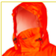
Three piece hood