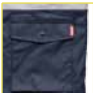
Two way pockets