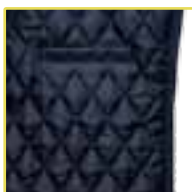
Internal quilted pocket