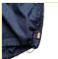
Internal draw cords