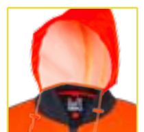
Three piece hood