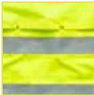
Back yoke ventilation