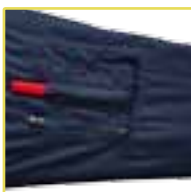
Left sleeve pocket with zip