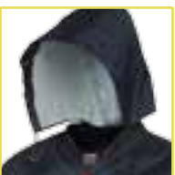
Three piece hood