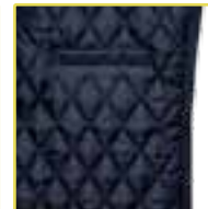
Internal quilted pocket