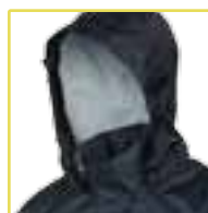
Three piece hood