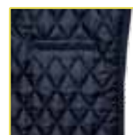
Internal quilted pocket