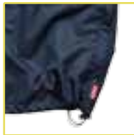
Internal draw cords