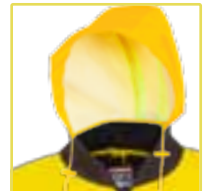
Three piece hood